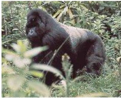
Mountain Gorilla (male)