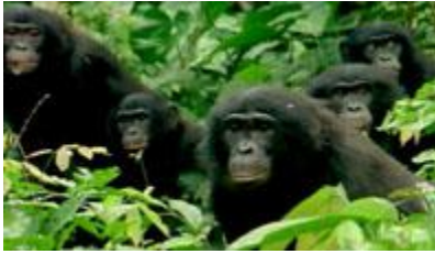
Bonobos The Last Great Ape