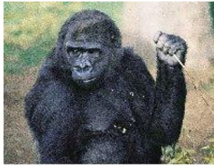
Western Lowland Gorilla (female)